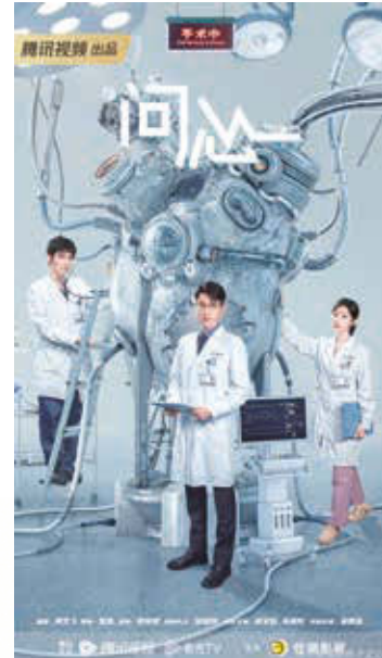
“The Heart” 《問心》