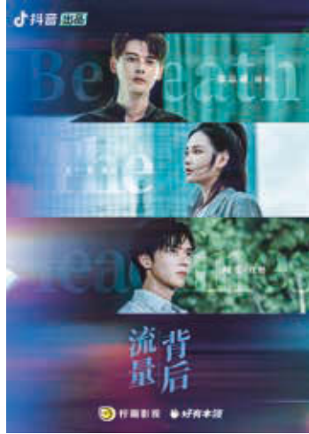
“Beneath the Headlines” 《流量背後》