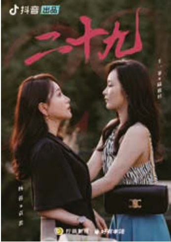
“Twenty Nine” 《二十九》