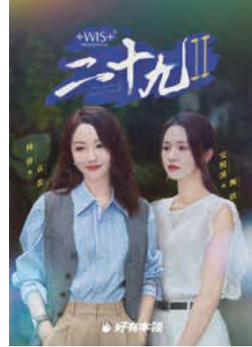
“Twenty Nine” Season 2 《二十九》第二季