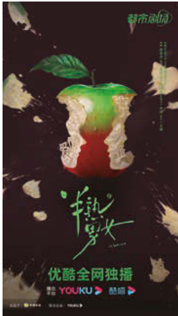
“In Between” 《半熟男女》