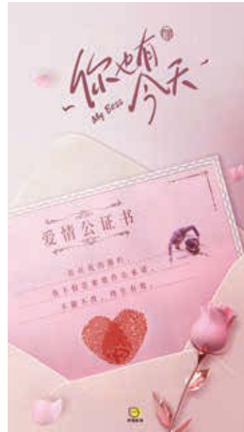
“My Boss” 《你也有今天》