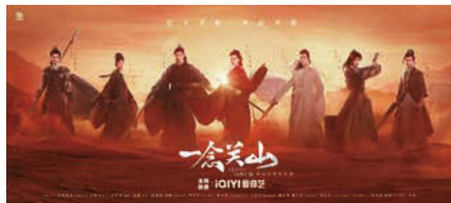
“A Journey to Love” 《一念關山》