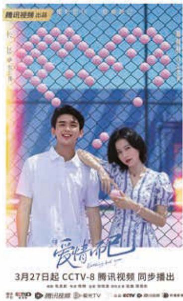
“Nothing But You” 《愛情而已》